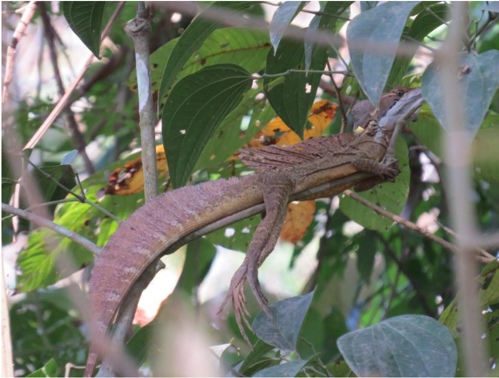
A Basalisk Lizard on the shores of the Tabacon River