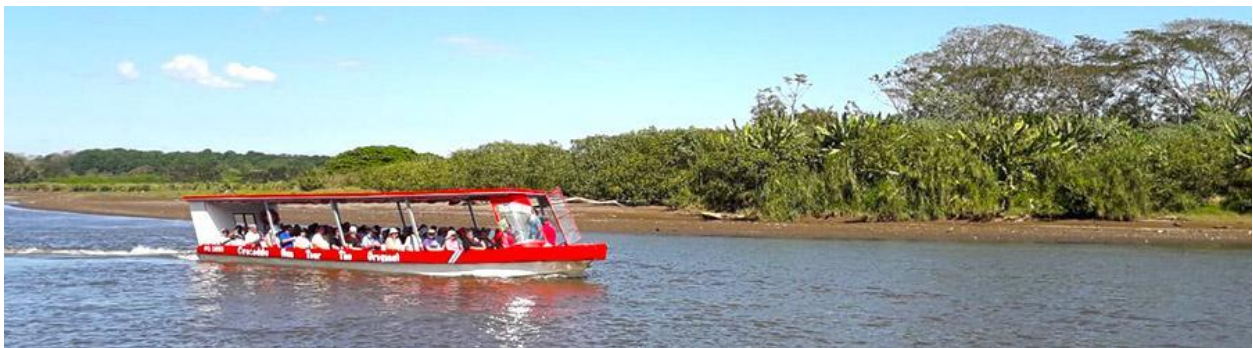
Cruise the Tarcoles River looking for birds like Fasciated Tiger Heron while getting up close and personal to American Crocodiles