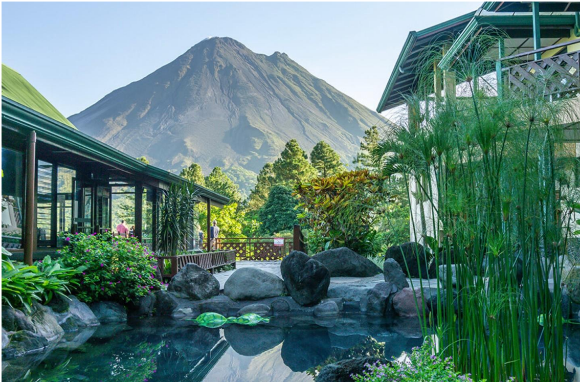
The view of the Arenal Volcano from the grounds of the Arenal Observatory Lodge