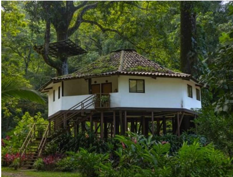
Villa Lapas Jungle Village will be our first stop on this one-of-a-kind tour. Villa Lapas is home to over 240 species of birds.