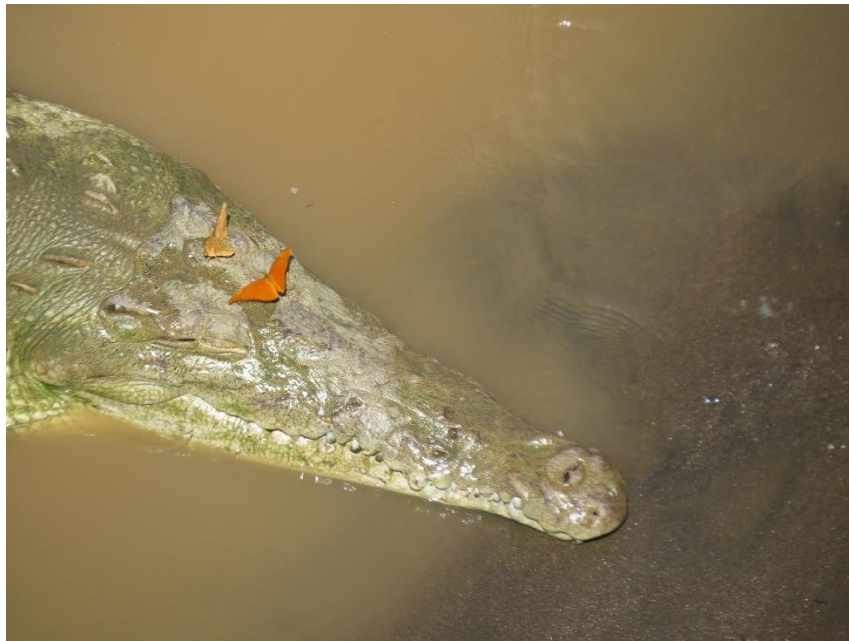
Usually several American Crocodiles can be seen from the Crocodile Bridge across the Tarcoles River