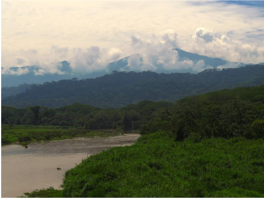
The Tarcoles River is home to one of the densest populations of American Crocodiles in the world