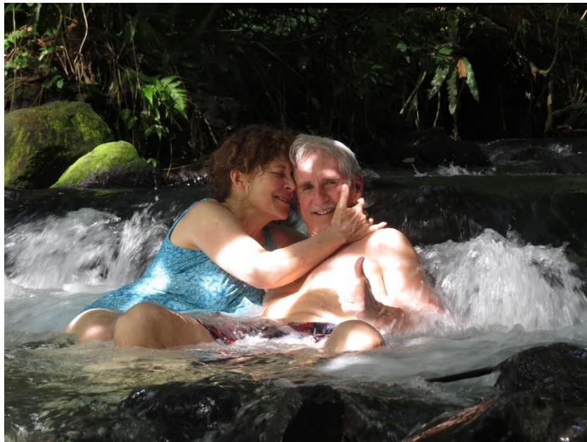
Relaxing in the hot springs on the Tabacon River, La Fortuna