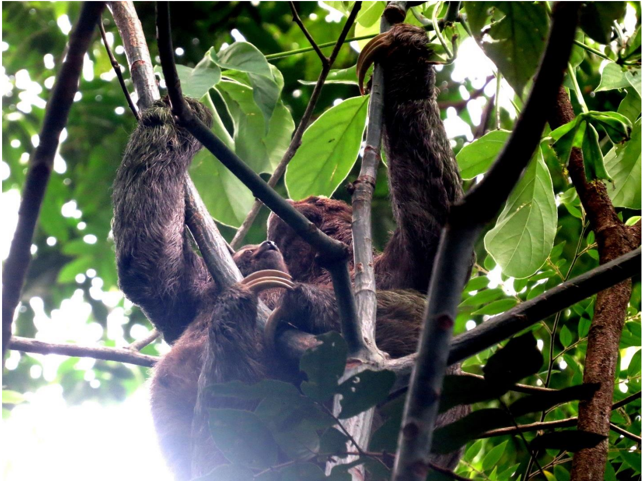
A Sloth and her baby climb into the canopy near Yatama Eco Lodge, Sarapiquí