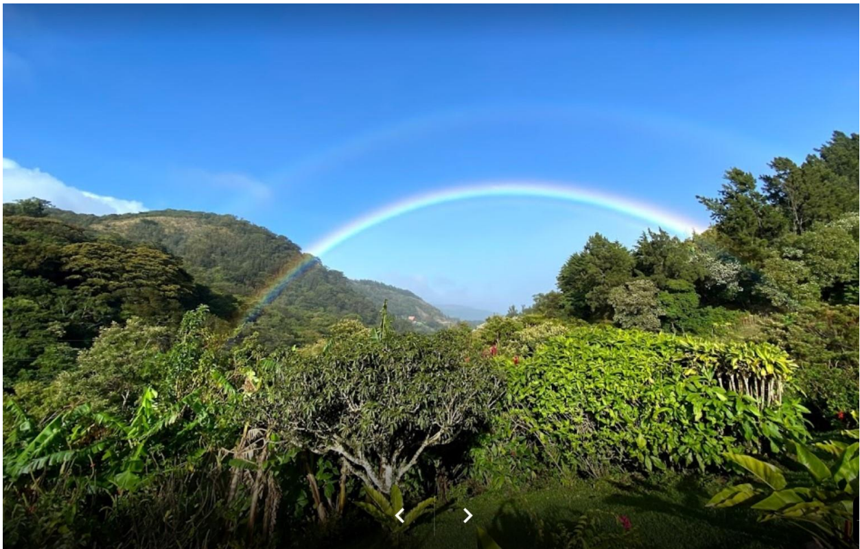
View from the room at the BelCruz B & B in Monteverde