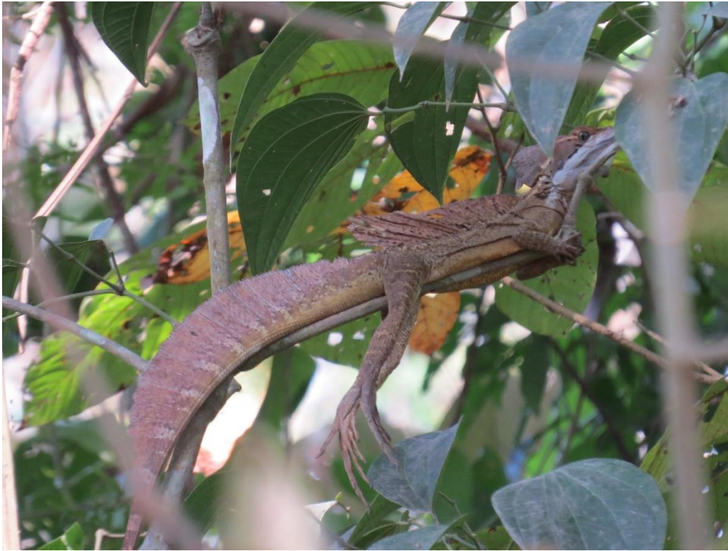
A Basalisk Lizard near La Fortuna