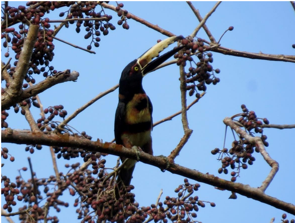
The Collared Aracari is one of several species of small toucans we may see