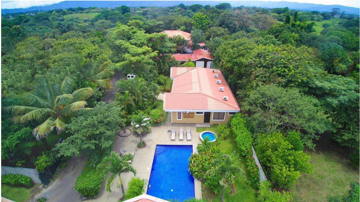
The lush vegetation around Hotel Robledal provides ample birdwatching opportunities only a short distance from the International Airport