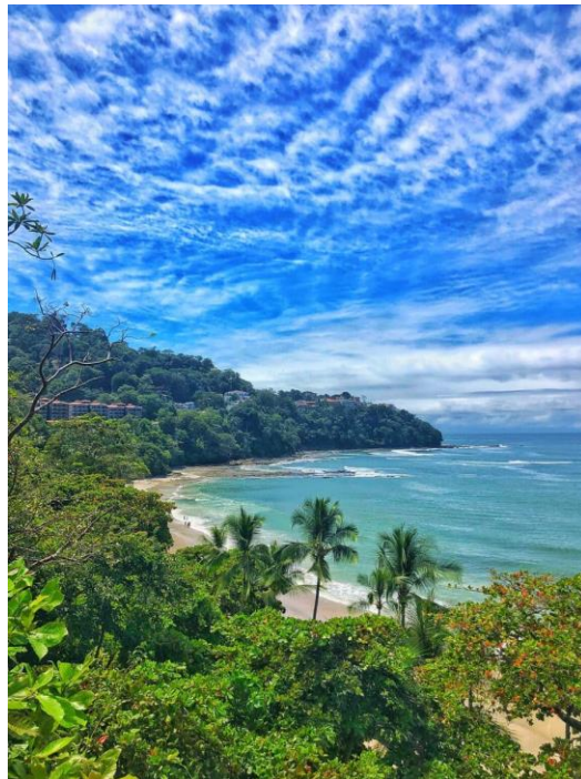
Playa Blanca is only a short drive from Villa Lapas