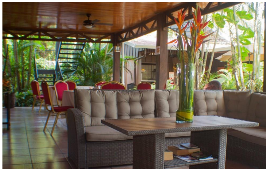
Hotel Robledal is a quiet oasis near the city of San Jose, Costa Rica