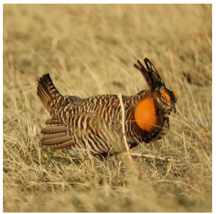
Watch the magnificent booming displays of Greater and Lesser Prairie Chickens in wide open expanses of short grass prairie, one of the most endangered ecosystems in the United States

April 27<sup>th</sup> – 30<sup>th</sup> 2025