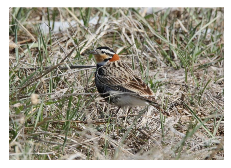
The Chestnut-collared Longspur is an iconic species of mixed-grass prairie and is one of the fastest declining birds in North America. We will look for them, along with Thick-billed Longspur, at strategic stops across the prairie

Lodging: <u>Doc's Bed and Breakfast</u> Meals included: Breakfast, Lunch, Dinner