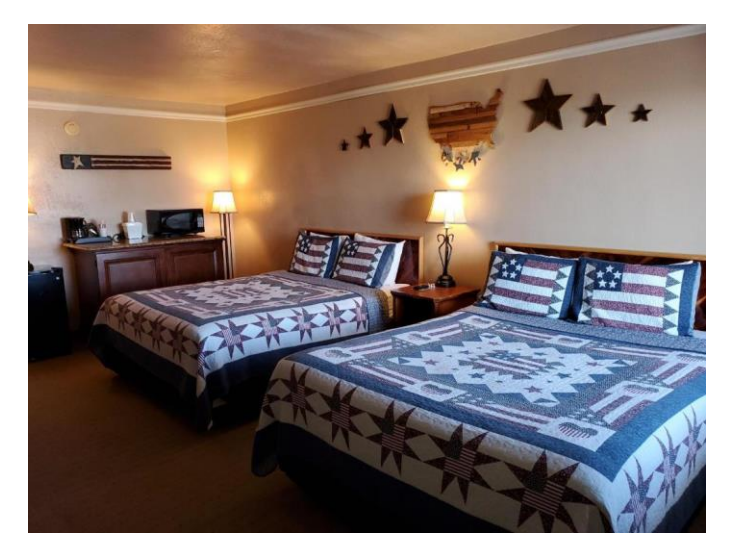
Enjoy a stay and a homemade breakfast at the hospitable Kansas Country Inn in Oakley, Kansas