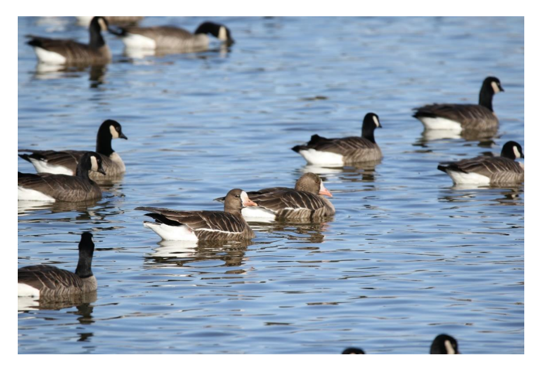
Greater White-fronted Geese mixed with a flock of Cackling Geese

Lodging: La Quinta Inn and Suites by Wyndham Denver International Airport Meals included: Breakfast, Lunch, Dinner