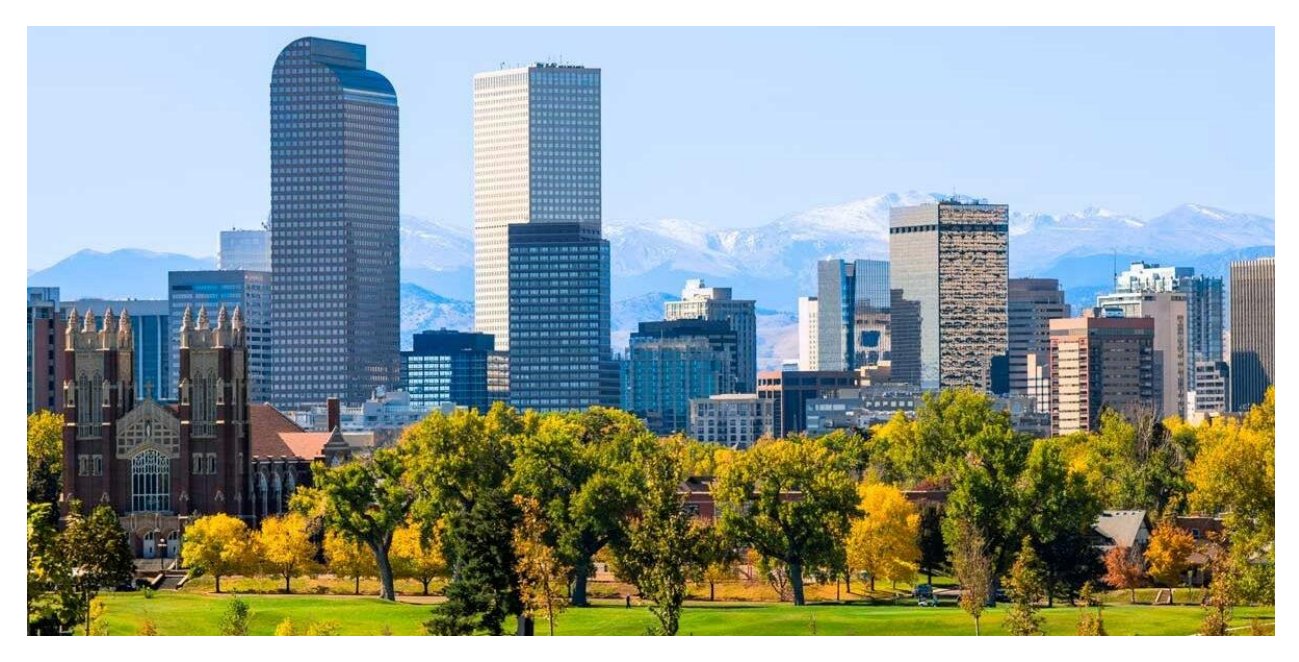
Your guide, Ryan Dibala, will greet you at the airport or pick you up at your hotel in Denver, Colorado