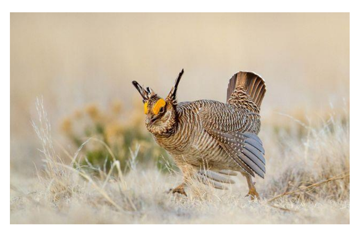
Lesser Prairie Chickens are listed as "Threatened" in Colorado and the viewing of leks is now prohibited in the state. Therefore, we will travel to Oakley, Kansas, where populations – although still designated as threatened - are more stable and controlled lek viewing is still permitted

Birding Man Adventures | www.gobirdingman.com | +1 860-455-3224 | ryan@gobirdingman.com