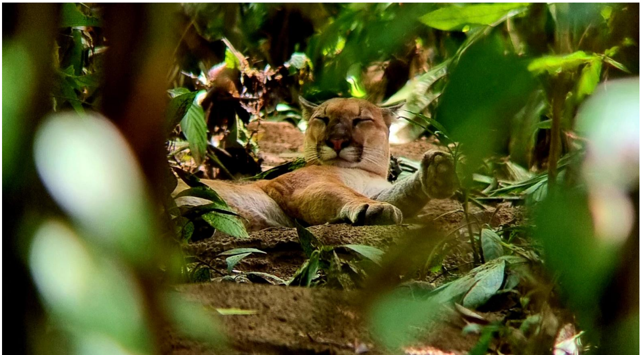
The puma is an elusive cat that can sometimes be found in the forests around Sirena