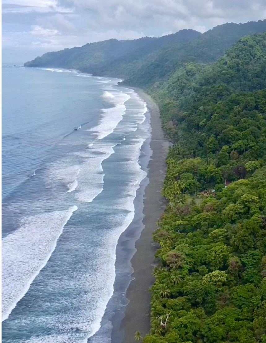
The wild coastline near Corcovado National Park