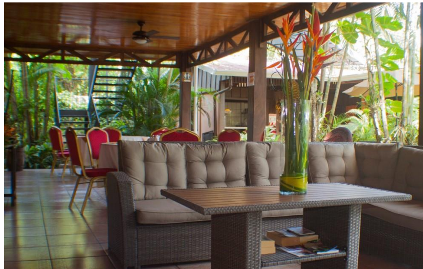
Hotel Robledal is a quiet oasis near the city of San Jose, Costa Rica