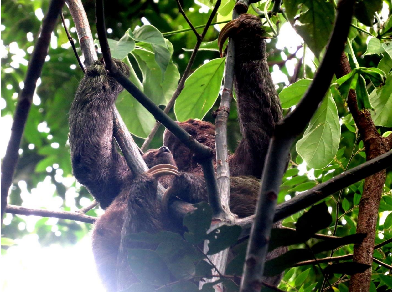
A three-toed sloth climbs into the canopy with her baby in tow