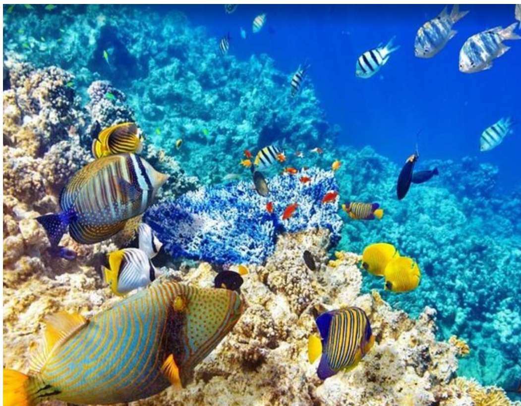
Isla del Caño is known as one of the best snorkeling and diving destinations in Costa Rica