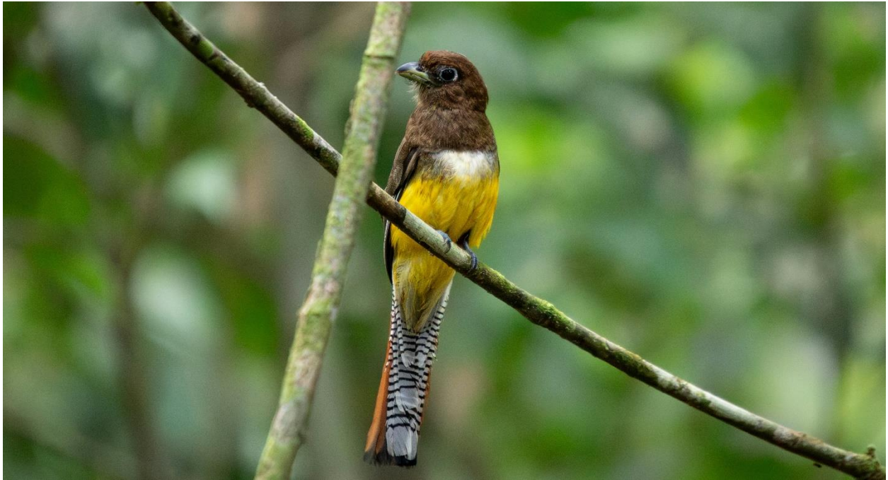
The Collared Trogon is one of several species of Trogons we may see.