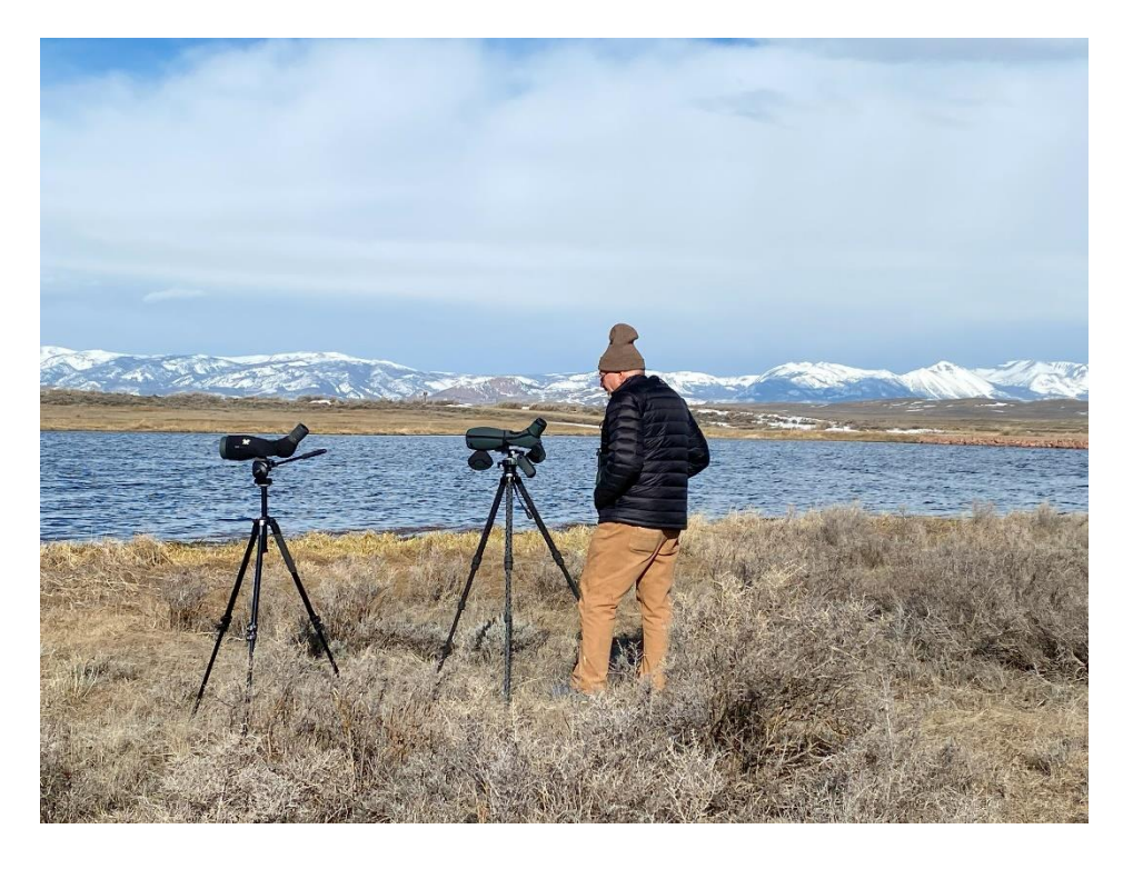
The Arapahoe National Wildlife Refuge protects over 24,000 acres in the middle of North Park

Lodging: <u>Antlers Inn</u> Meals included: Breakfast, Lunch, Dinner