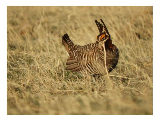
Photographing Greater Prairie Chickens (left). A male Greater Prairie Chicken raises his philoplumes in preparation for a dispute with a nearby male (right). Indigenous Plains tribes like the Shoshone and Pawnee were said to have modeled their dances after the mating display of the Prairie Chickens