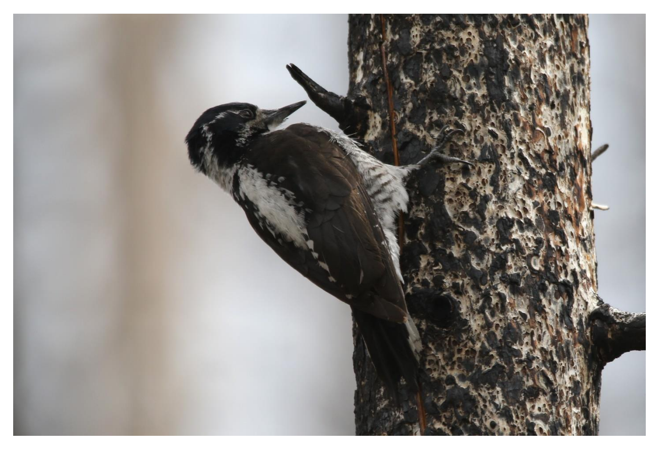
The American Three-toed Woodpecker can be found foraging in stands of beetle-infested trees near Rabbit's Ears Pass

Birding Man Adventures | www.gobirdingman.com | +1 860-455-3224 | ryan@gobirdingman.com