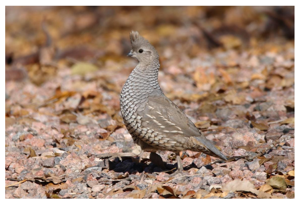
Scaled Quail are a fairly common site in the neighborhood of Pueblo West