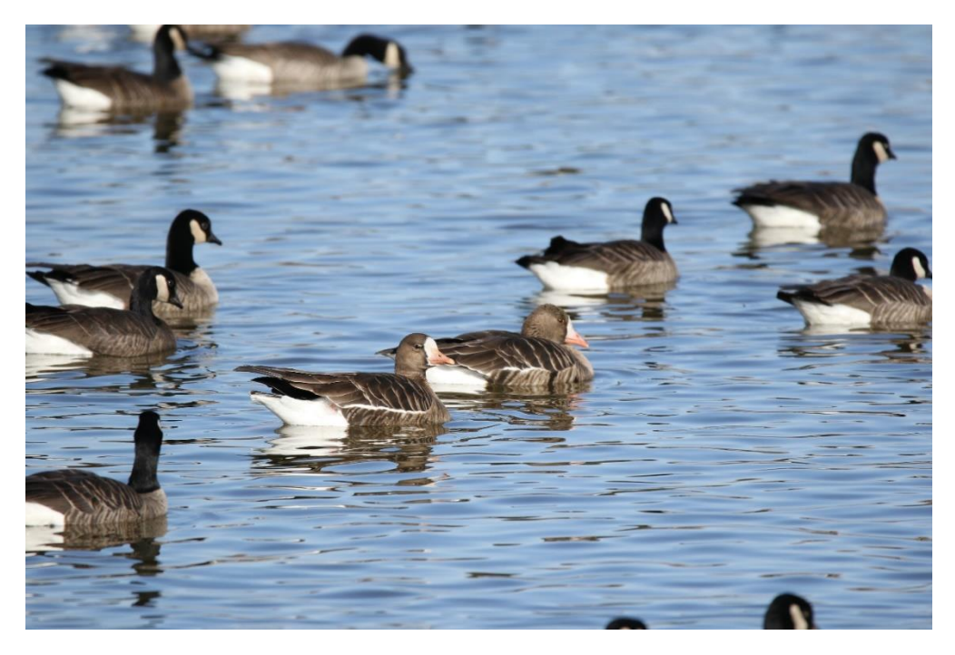
Greater White-fronted Geese mixed with a flock of Cackling Geese

Lodging: La Quinta Inn and Suites by Wyndham Denver International Airport Meals included: Breakfast, Lunch, Dinner