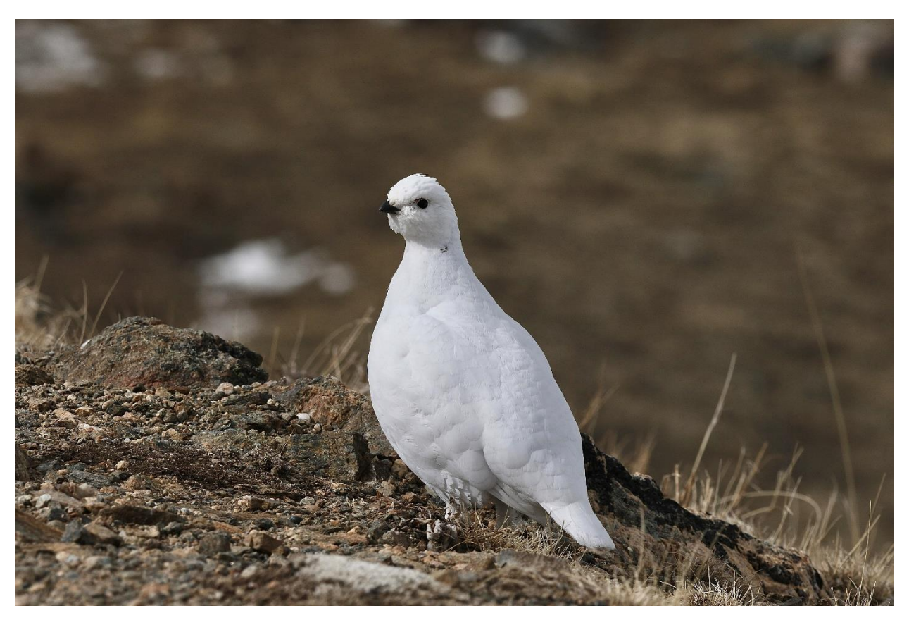
White-tailed Ptarmigan in its winter plumage at Loveland Pass