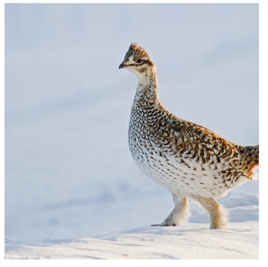
Sharp-tailed Grouse near Steamboat Springs