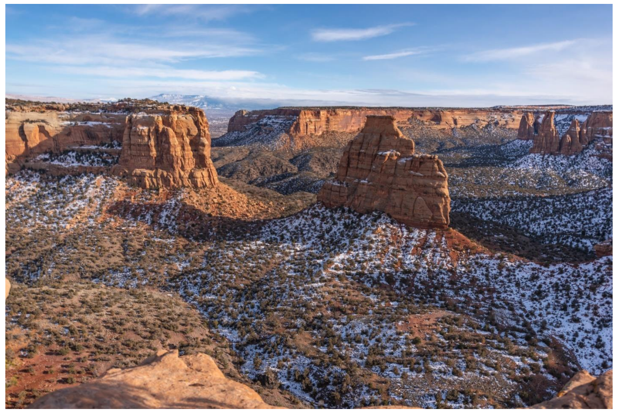
Colorado National Monument offers sweeping views of red rocks and canyon country