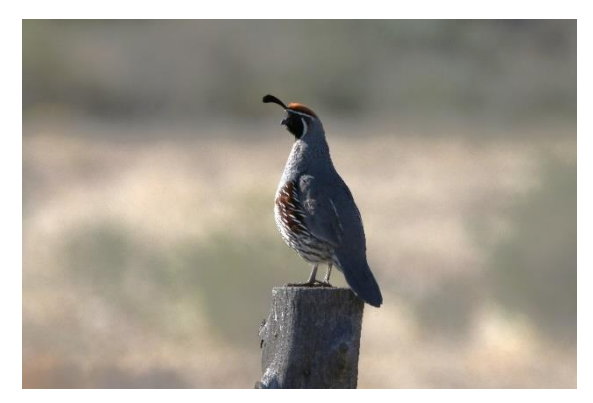
It is not uncommon to find coveys of Gambel's Quail along the roads near Colorado National Monument