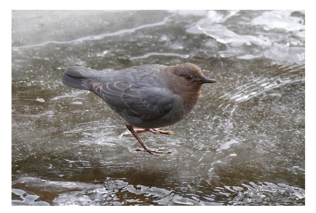
The American Dipper can be found along streams in the mountains near Crested Butte

Lodging: <u>The Inn at Tomichi Village</u> Meals included: Breakfast, Lunch, Dinner