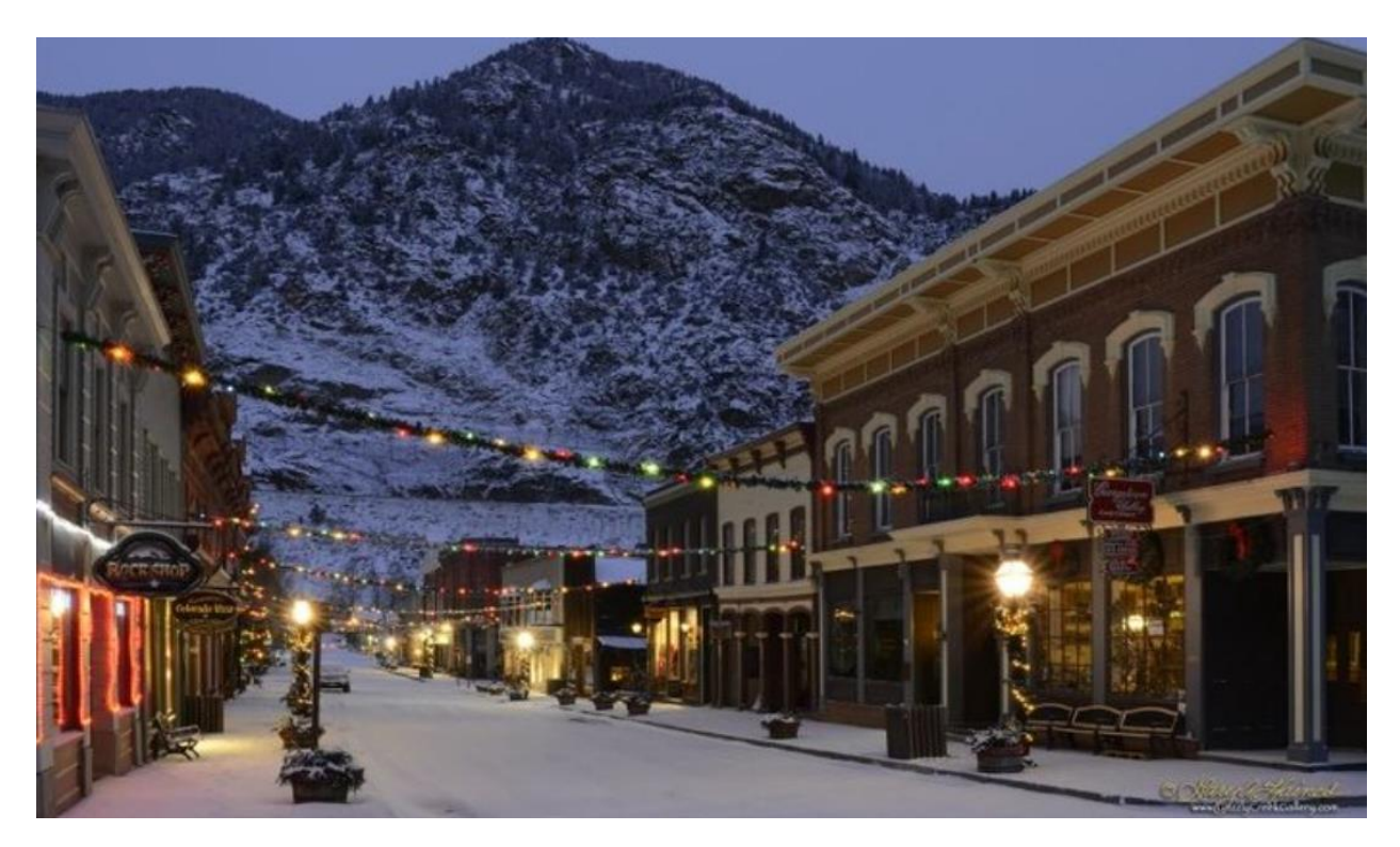
The main street of Georgetown looks like it could be from straight out of a western movie