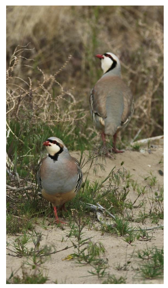
Chukars at Coal Canyon