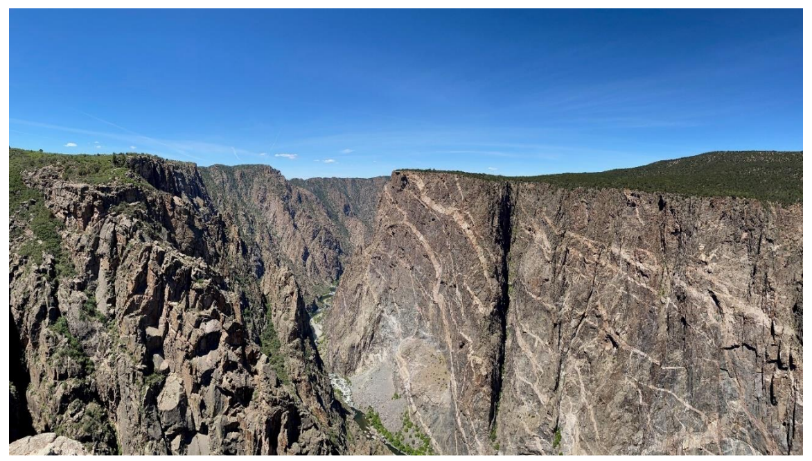
Black Canyon of the Gunnison National Park and its steep canyon walls are home to Canyon Wrens and White-throated Swifts while the surrounding pinyon pine – oak woodlands support healthy populations of Dusky Grouse