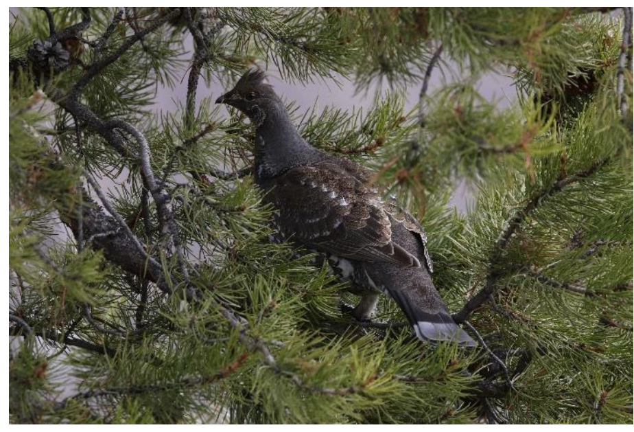
Dusky Grouse can sometimes be found displaying in open areas at Black Canyon