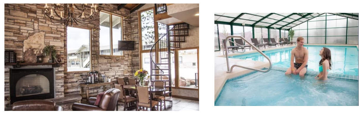
Enjoy one night at the Inn at Tomichi Village near Gunnison, Colorado