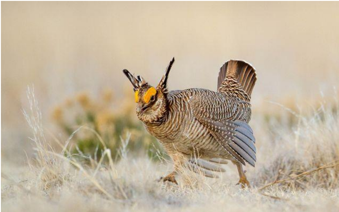
Lesser Prairie Chickens are listed as “Threatened” in Colorado and the viewing of leks is now prohibited in the state. Therefore, we will travel to Oakley, Kansas, where populations – although still designated as threatened - are more stable and controlled lek viewing is still permitted