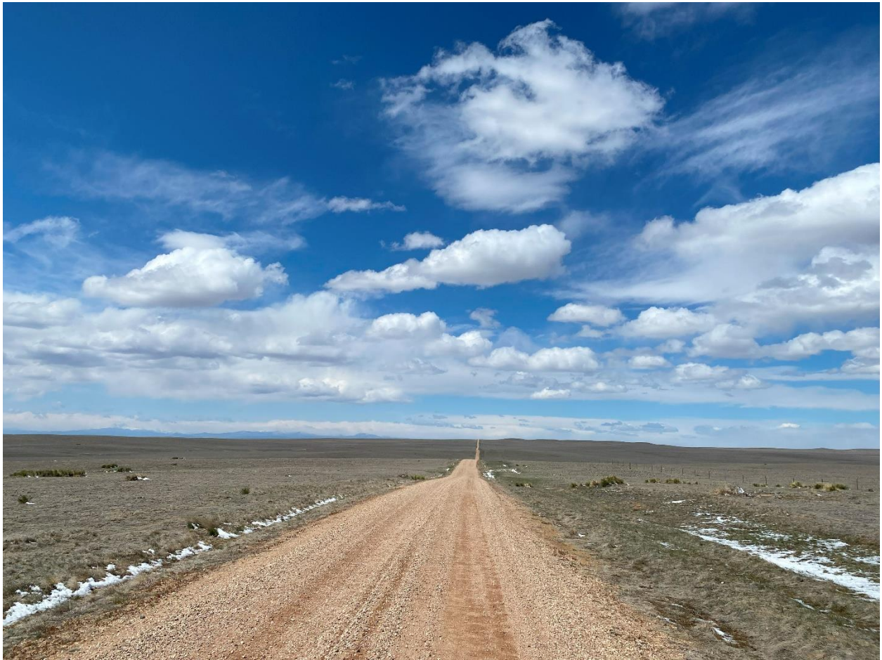
The shortgrass prairie of Pawnee National Grasslands in late April can be filled with great treasures