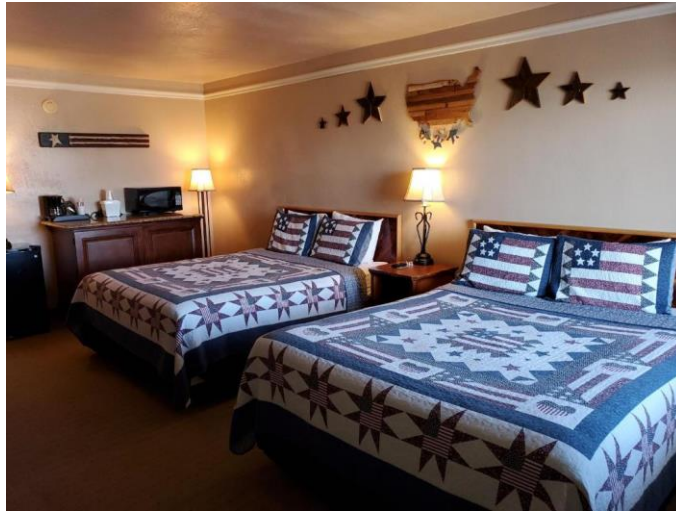
Enjoy a stay and a homemade breakfast at the hospitable Kansas Country Inn in Oakley, Kansas